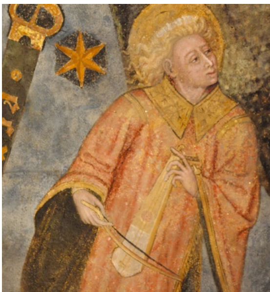
Fig. 1 Angel musician with rabab , 1416/17, tempera and oil, Collegiate Church of Saint-Bonnet-le-Château, vault of Saint Michael's Chapel (Photo: Yuko Katsutani, with kind permission of Saint-Bonnet-le-Château).