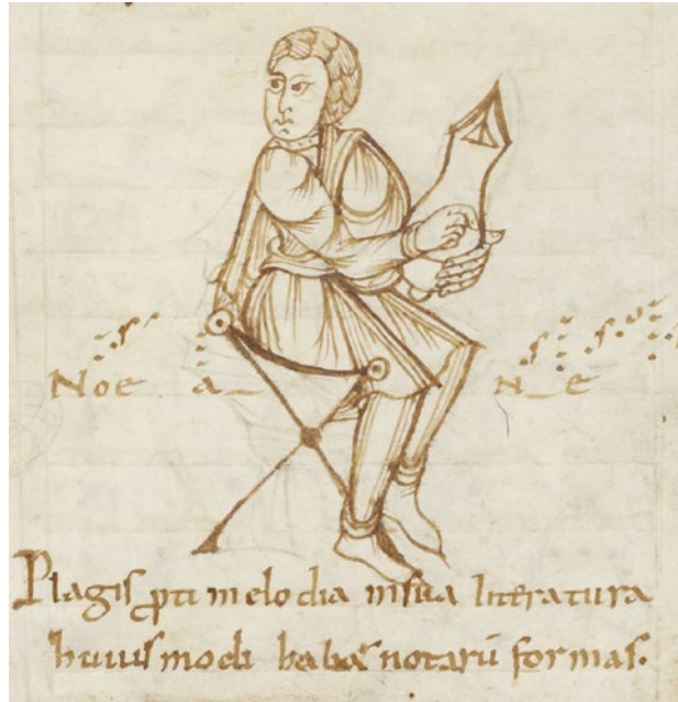
Fig. 7 Second tone, in: Aurelian n.d., f. 137v (end of the eleventh or beginning of the twelfth century).

fact that eight jugglers on two capitals at the Cluny Abbey (ca 1100) symbolise the eight tones has already been highlighted by several scholars. 37 Kathi Meyer lists various examples of sculptures and illustrations of manuscripts bearing traces of the same symbolism, such as the illustrations in the Tropaire d'Auch (987–996; Fig. 6), 38 in the Musica Disciplina of Aurelian of Réôme (late eleventh or early twelfth century; Fig. 7), 39 in the Sermones Dominicales (last quarter of the thirteenth or first quarter of the fourteenth century) 40 and in a Byzantine psalter (eleventh century). 41 For observers familiar with the principles of liturgical chant, a depiction of eight musicians could thus have suggested the eight Gregorian modes in use in the music of the time. 42