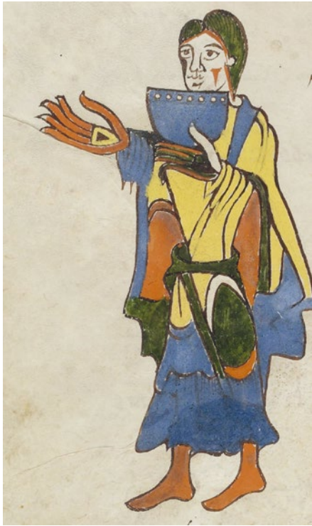
Fig. 6 Third tone, in: Tropaire d'Auch , f. 106v (ca 990–1010).