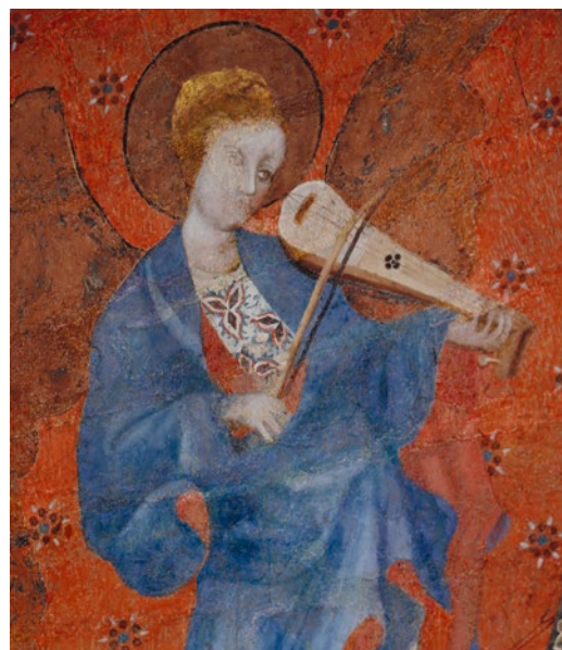
Fig. 2 Angel musician with rabab , 1370–1378, murals applied directly on stone without a fixed layer of preparation, with wax used for some parts (encaustic painting), Le Mans, Cathedral of Saint-Julien, vault of the Virgin's Chapel (Photo: Yuko Katsutani, with kind permission of Le Mans).