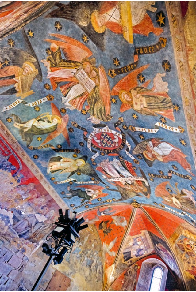
Fig. 5 Musician angels and the coat of arms of the Dukes of Bourbon and the belts of Espérance, 1416–1417, tempera and oil, Collegiate Church of Saint-Bonnet-le-Château, vault of Saint Michael's Chapel (Photo: Yuko Katsutani, with kind permission of Saint-Bonnet-le-Château).

On the chapel vault of Saint-Bonnet, a musical excerpt from a Mass of the Assumption is linked to the belt of Espérance , underlining the link between the two. This music is presented here, not just because in chronological terms the Assumption precedes the Coronation of the Virgin that is depicted on the western wall, but also because it honours Louis II in the context of his Marian devotion.