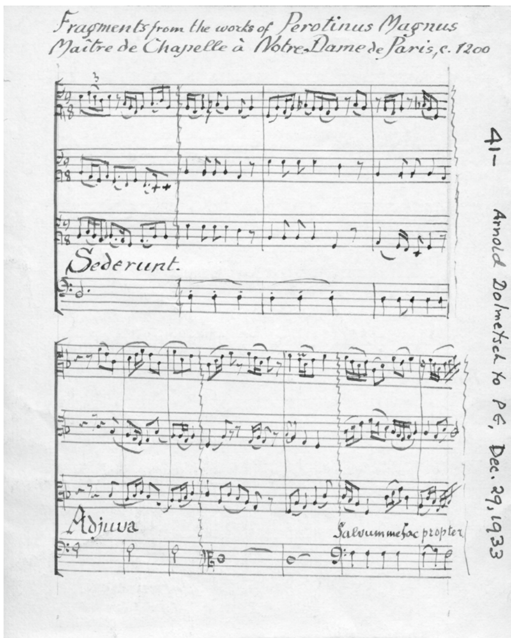
Fig. 7 Arnold Dolmetsch, arrangement of Pérotin's Sederunt (excerpt), sent to Percy Grainger in a letter of 29 December 1933 (DolmetschA 1933, reproduced by permission of the Estate of George Percy Grainger and the Dolmetsch family).

position of the bridge. The sound now emerges very easily and is of an extraordinary beauty.” 99 In his article of 1934, Arnold wrote: