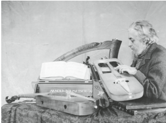
Fig. 1 Arnold Dolmetsch posing with (clockwise from top) a clarsach, crwth, rebec, tenor rebec, and a small virginal or octavina. Cambridge University Library, Jeanne-Marie Dolmetsch Collection, Ms. Add. 10371/C: Photographs and family documentation, Dolmetsch Photographs I–VI, Dolmetsch Photographs II, No. 92.