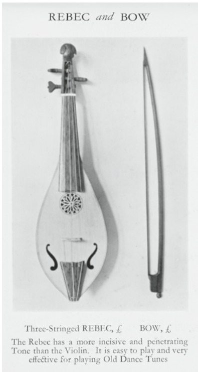
Fig. 3 Photograph of rebec and bow in DolmetschA 1930a, p. 15

First, however, it is useful to reflect on historiography relating to the Dolmetsches’ revival of the rebec. In literature by members of the family, or about them, this instrument is mentioned only occasionally, since it was overshadowed by the revival of others (such as the viol, lute and recorder). Surprisingly, Arnold himself does not discuss the instrument in an autobiographi-